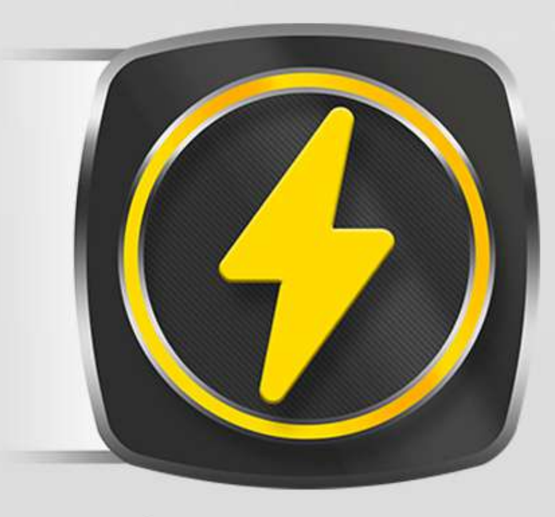
High Voltage Isolation