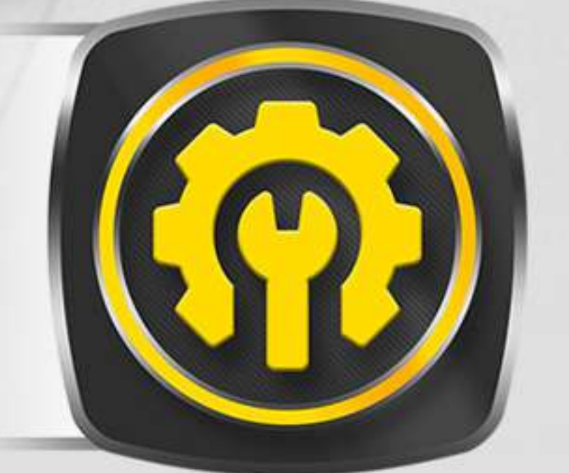
Ease Of Installation

2) Our product SSZ20-240000/220 has passed the short circuit withstand capacity and all routinetypetests of the National Transformer Quality Supervision and Inspection Center. 3. This product has the characteristics of stability, reliability, economy and environmental protection, and suitable for power plants, substations, large industrial, mining and petrochemical enterprises, etc.