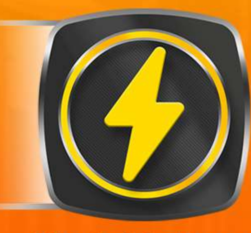
High Voltage Isolation