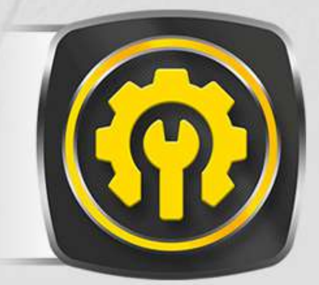
Ease of Installation

Enamelled round aluminum wire is one of the main types of electromagnetic wire. It consists of bare wire which is annealed and softened by conductor and insulating layer, and then after repeated spraying and baking. But to meet the standard requirements of production, but also to meet customer requirements of the product is not easy, it is affected by raw material quality, processing parameters, production equipment and environmental factors, therefore, all kinds of enamoured wire quality characteristics are not the same, but have high temperature resistance, mechanical properties, electrical and chemical. Chemical properties