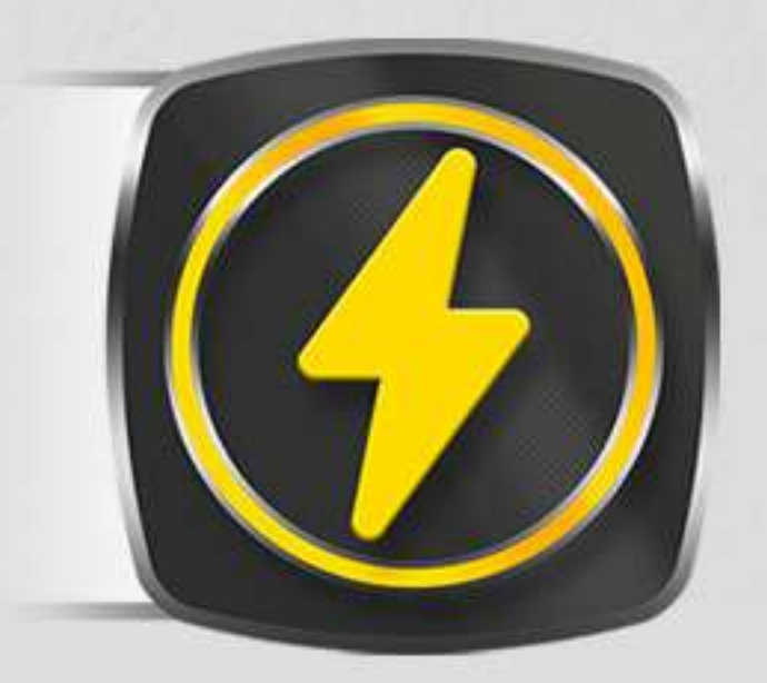
High Voltage Isolation