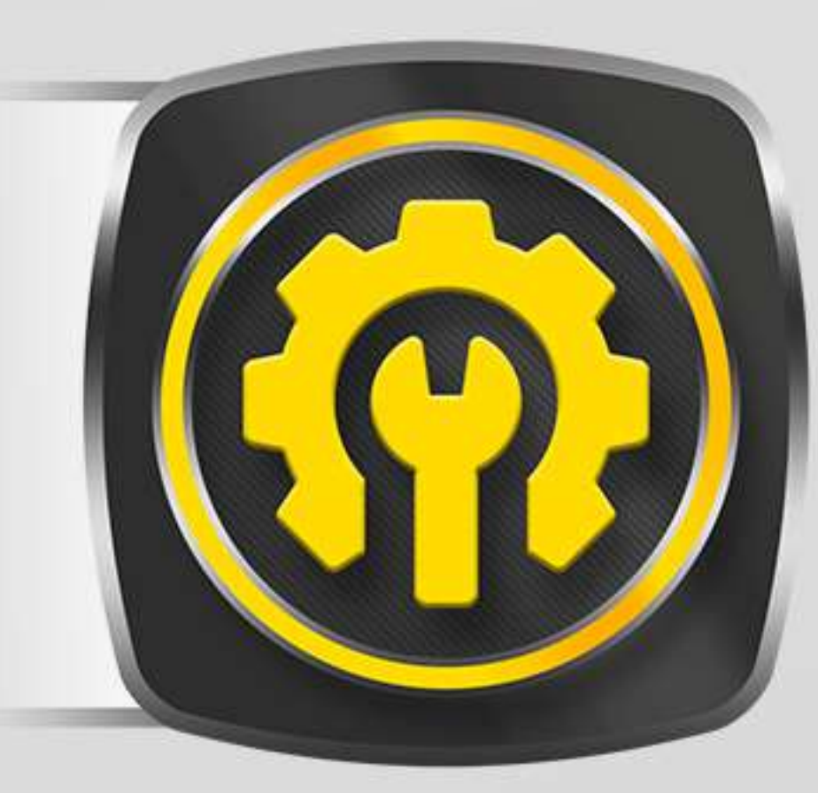
Ease of Installation

Enamelled flat wire is a wire drawn or extruded by a specific-specification die of an oxygen-free copper rod or an electrician's round aluminum rod. The drawn bare wire is softened by annealing and then painted and baked for several times. Mainly used in transformer, reactor and other electrical equipment winding.