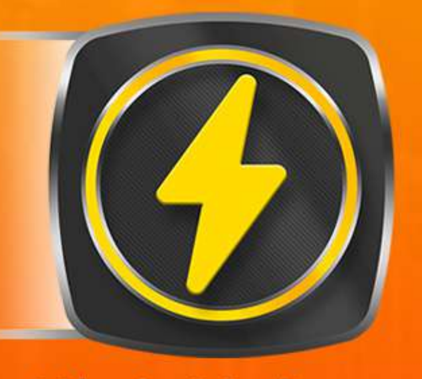
High Voltage Isolation