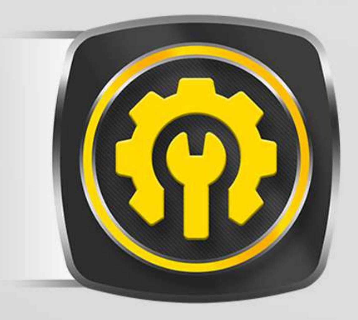
Ease of Installation