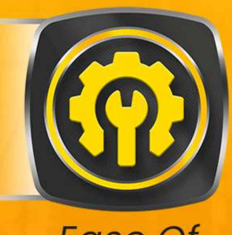
Ease Of Installation