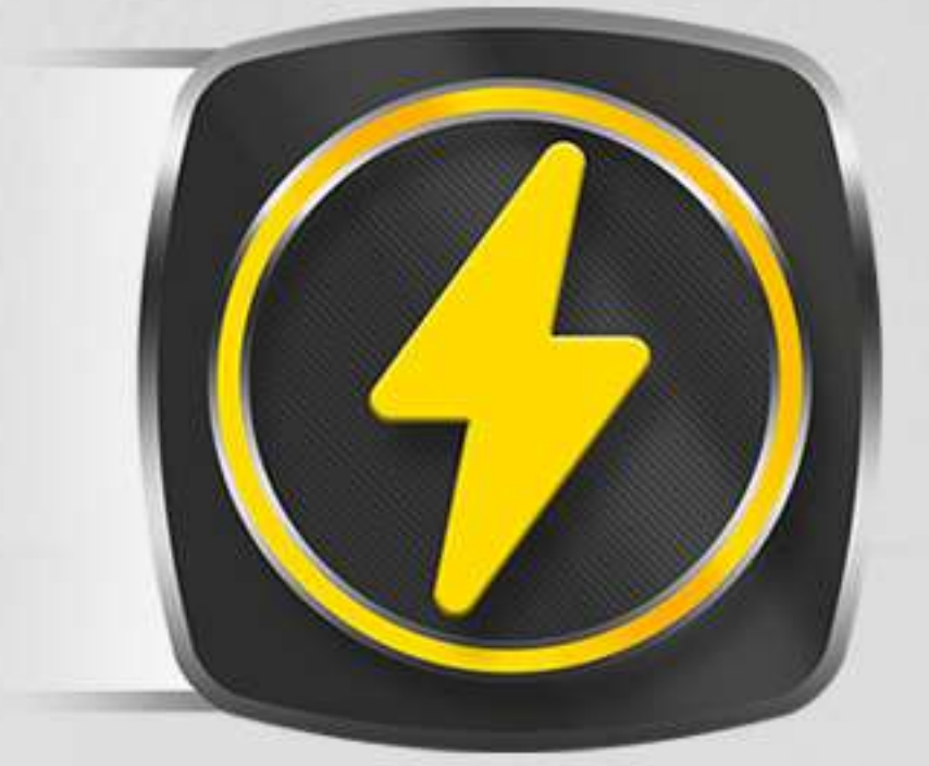
High Voltage Isolation