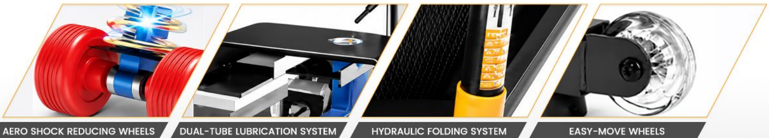
AERO SHOCK REDUCING WHEELS