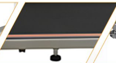
ADJUSTABLE LEVELING PADS