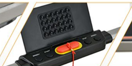
PHONE HOLDER (REMOVEABLE)