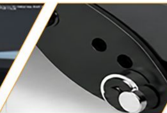
3 LEVELS MANUAL INCLINE