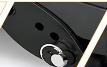
3 LEVELS MANUAL INCLINE