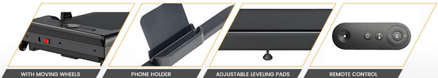
WITH MOVING WHEELS