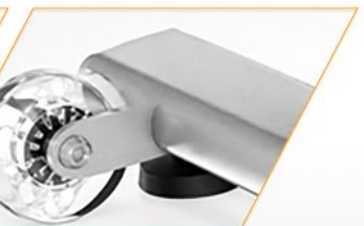
FRONT TRANSPORT WHEELS