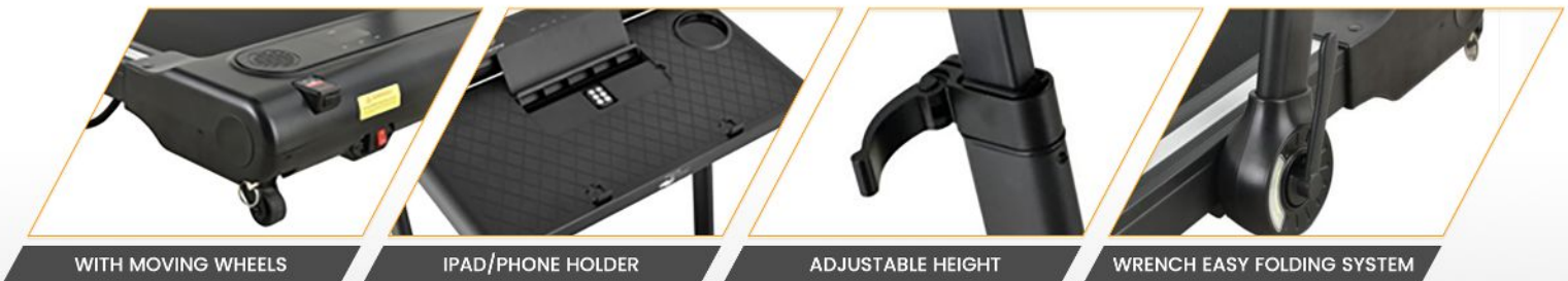
WITH MOVING WHEELS