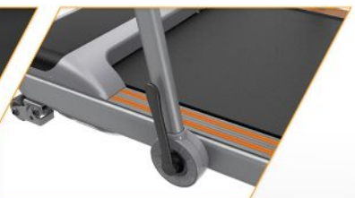
WRENCH EASY FOLDING SYSTEM