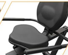
HIGH DENSITY FOAM