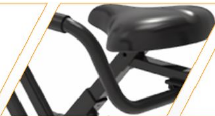
ADJUSTABLE SEAT & HANDLEBAR