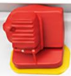
INTEGRATED IPAD/PHONE HOLDER