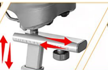
ADJUSTABLE SEAT & HANDLEBAR