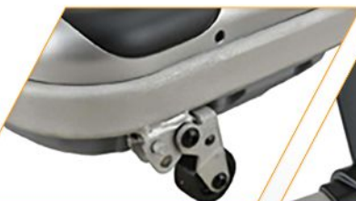
WITH MOVING WHEELS